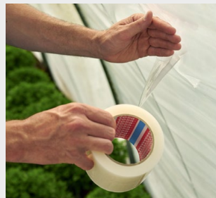
Step 3: Repeat on the inner layer