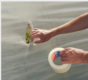
Step 1: Check film regularly for damages