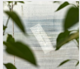
Results: Healthy plant growth all year round

Product available in 50 mm, 75 mm, 100 mm and 150 mm width; 33 m length. Please contact us for further information.